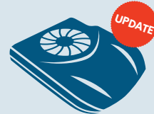
48V X3 NOMADIC™ A/C