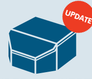
CYBER SHOWER™ (RECIRCULATING)