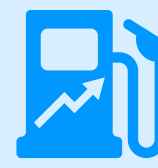
LONG RANGE FUEL TANK