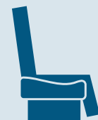
VANHALLA ™ SEAT